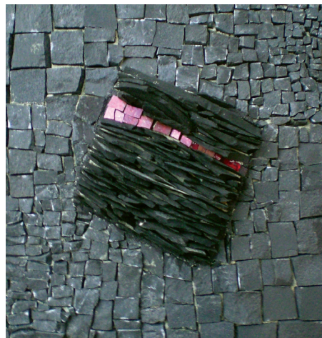
Harriet de Wit (9) / Special Award