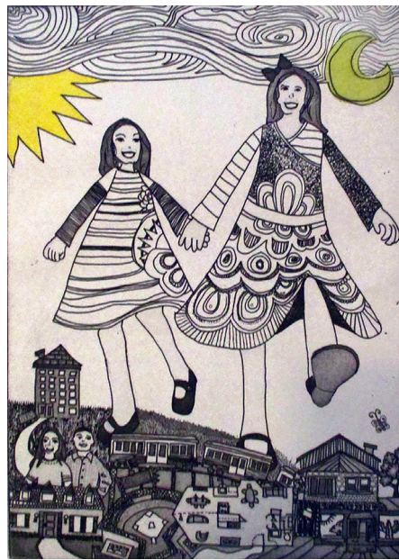
Hope Salmanoff (33) / Special Award