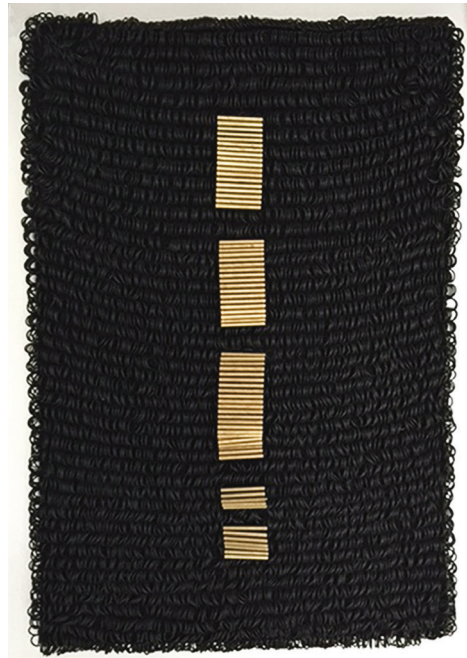
Shirley Engelstein (11) / Best of Show