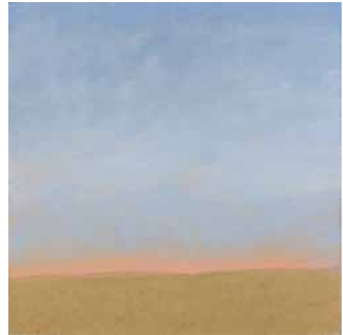
Sara Peak Convery (12) Honorable Mention