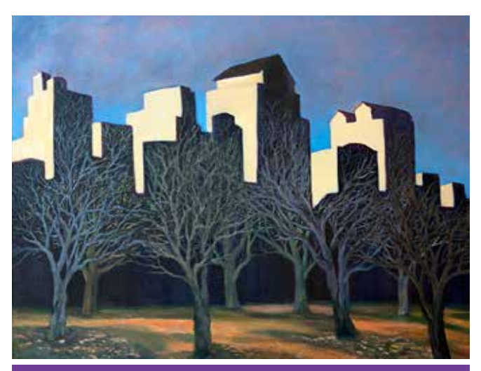
Sandra Holubow, Nature's Playground (22) Best in Show