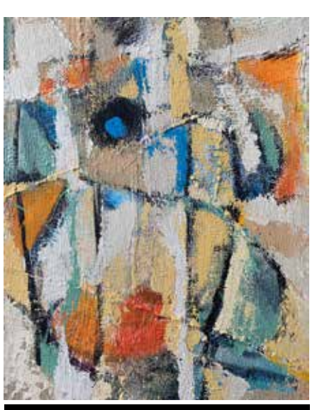
Susan Bennett, Eye of Day (6) Honorable Mention