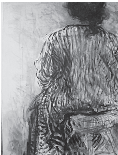
Judith Roth (35) / Honorable Mention