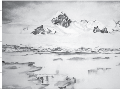
Selma Lisit (21) / Special Award