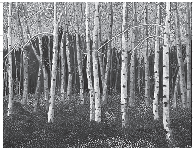
Istvan Steven Gal (3) / Honorable Mention